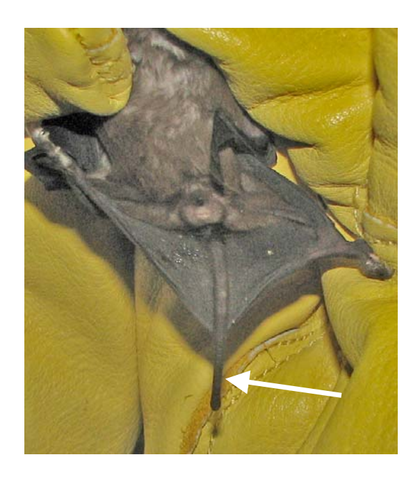
Figure 12. A close up photograph of M. molossus showing the detail of the bat's uropatagium and the extension of the tail (arrow) beyond the membrane.

Monophyllus plethodon- long-tongued bat (Figures 13-16)