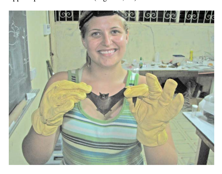
Figure 17. A picture of T. brasiliensis showing the overall appearance and size of the bat.

Tadarida brasiliensis can be easily distinguished from all of the other bats except for M. molossus because its tail extends well beyond the uropatagium (e.g. more so than M. plethodon ) (Fig 20). Tadarida brasiliensis can still be easily distinguished from M. molossus because it has deeply ridged upper lips (Figs. 18, 19) as opposed to the smooth upper lips of M. molossus (Figs. 10, 11).