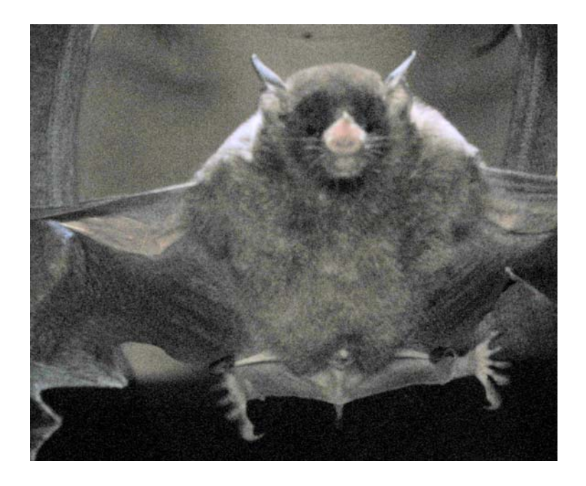
Figure 14. A photograph showing the detail of M. plethodon as viewed from the front as well as the overall appearance of the bat.