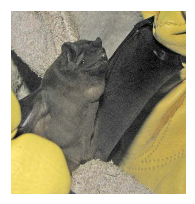
Figure 10. A close up photograph of M. molossus showing the detail of the bat's face and body.