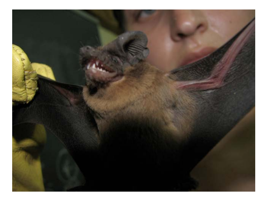
Figure 19. A close up picture of T. brasiliensis showing the detail of the bat's face and body as viewed from the side.