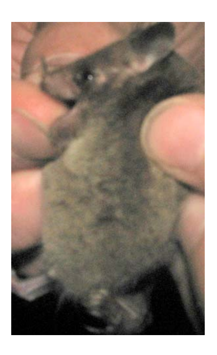
Figure 15. A close up photograph of M. plethodon showing the details of the face as viewed from the side.