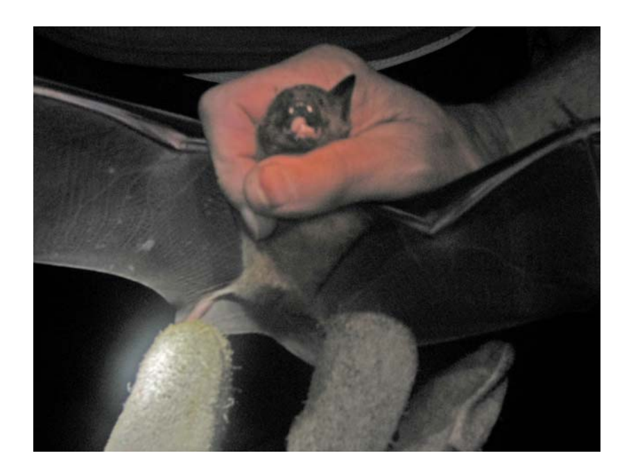
Figure 5. A picture of B. cavernarum showing the bat's overall size as compared to the hands of an adult man.