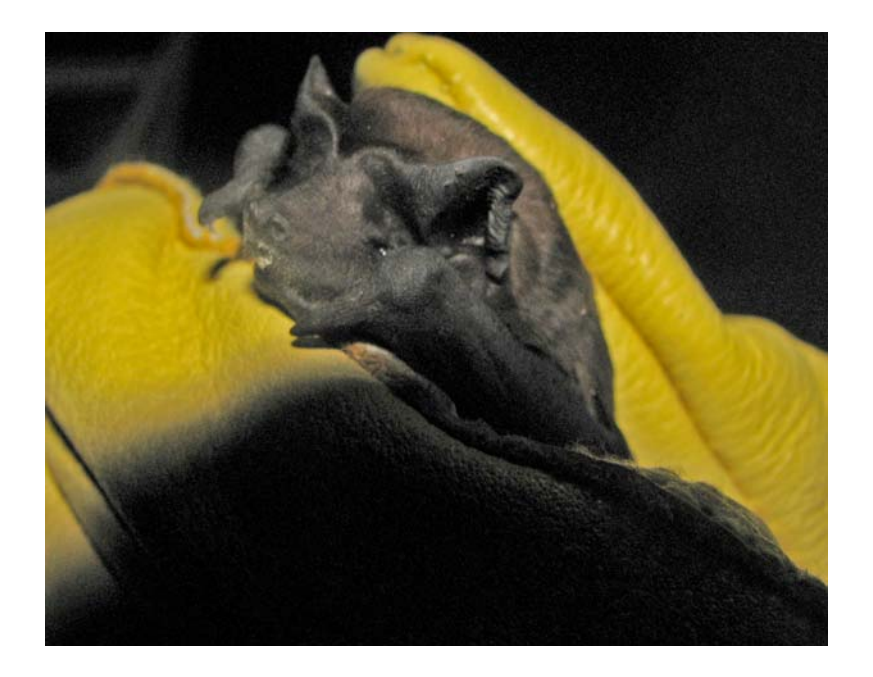
Figure 11. A close up photograph of M. molossus showing the detail of the bat's face as viewed from the side as well as the details of the bat's ear.