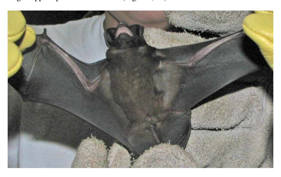
Figure 9. A close up picture of M. molossus showing the bat's overall appearance.

Molossus molossus can be easily distinguished from all of the other bats except for T. brasiliensis because its tail extends well past the uropatagium (e.g. more so than M. plethodon ) (Fig 12). Molossus molossus can still be easily distinguished from T. brasiliensis because it has smooth upper lips (Figs 10, 11) as opposed to the deeply ridged upper lips of T. brasiliensis (Figs. 18, 19).