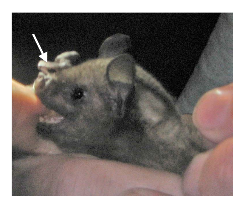
Figure 7. A close up photograph of B. cavernarum showing the detail of the bat's face as viewed from the side as well as the details of the bat's ear. This picture also shows the thumb (arrow) of one of the bat's wings behind the nose. This is not to be confused with its nose leaf.