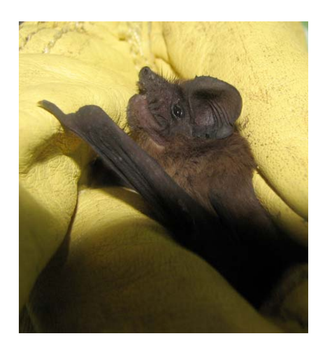
Figure 18. A close up photograph of T. brasiliensis showing the detail of the bat's face (including the ridges on the upper lip) and ear.