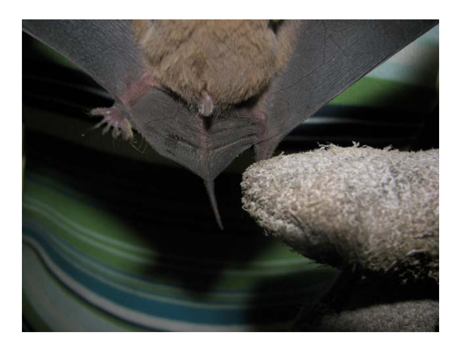
Figure 20. A close up photograph of T. brasiliensis showing the detail of the bat's uropatagium and tail.