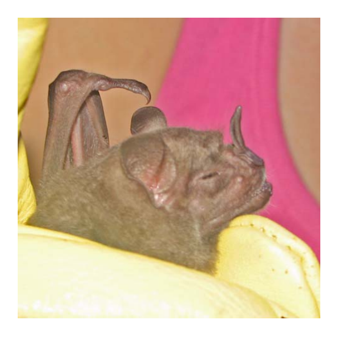
Figure 3. A close up photograph of A. jamaicensis showing the detail of the bat's face as viewed from the side as well as the details of the bat's ear.