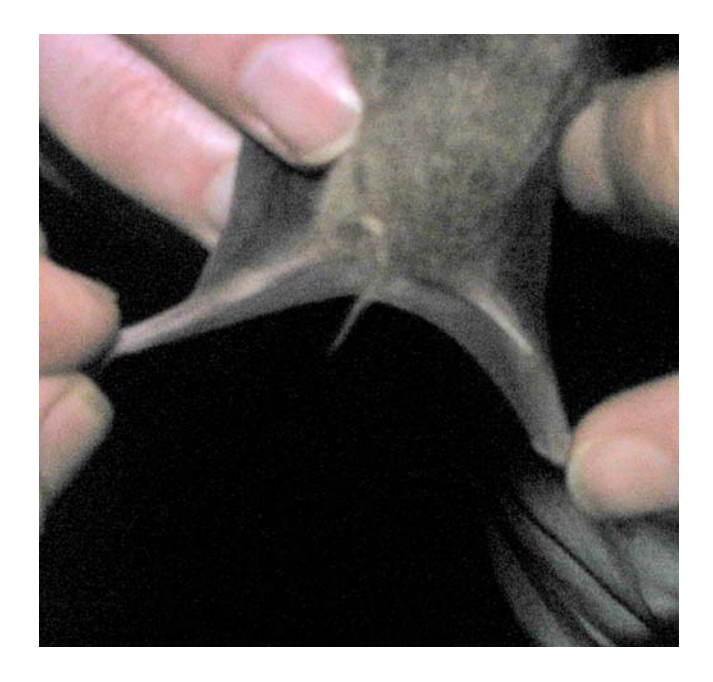
Figure 16. A close up photograph of M. plethodon showing the detail of the bat's uropatagium and its tail.