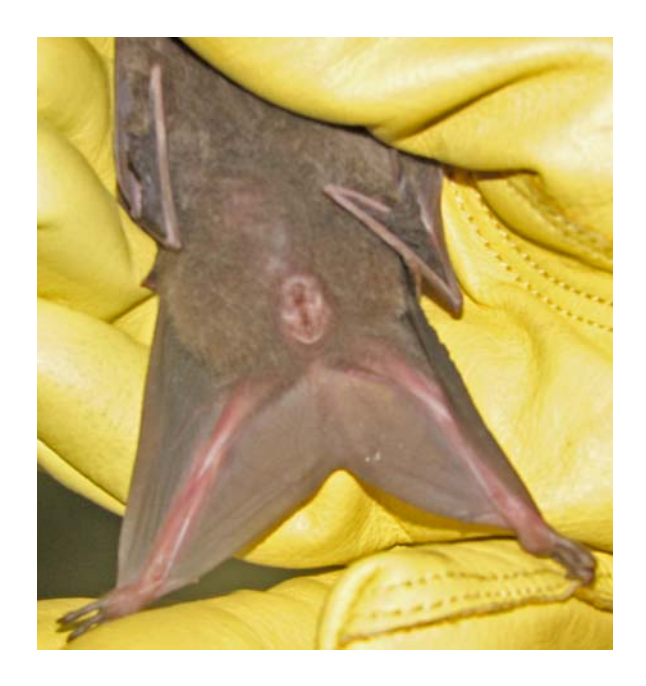
Figure 4. A close up photograph of A. jamaicensis showing the detail of the bat's "U" shaped uropatagium and lack of a noticeable tail.

Brachyphylla cavernarum- Lesser Antillean fruit bat (Figures 5-8)