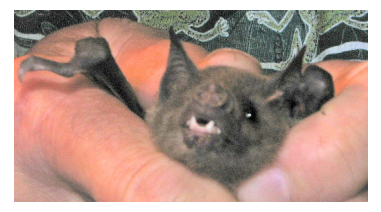
Figure 6. A close up photograph of B. cavernarum showing the details of the bat's face and nose-leaf.