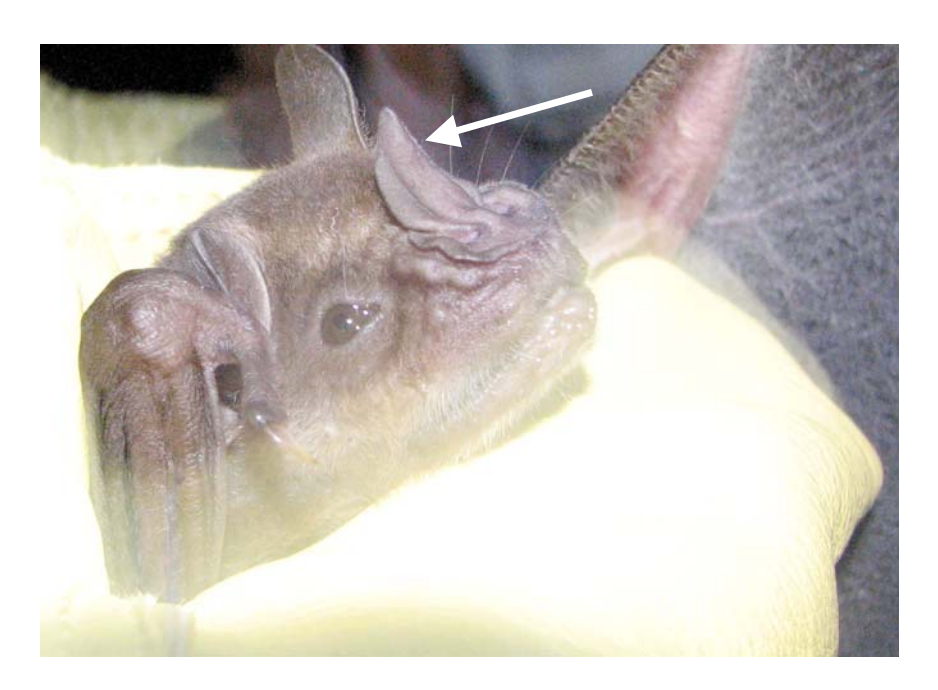
Figure 2. A close up photograph of A. jamaicensis showing the detail of the bat's face and nose-leaf (arrow).