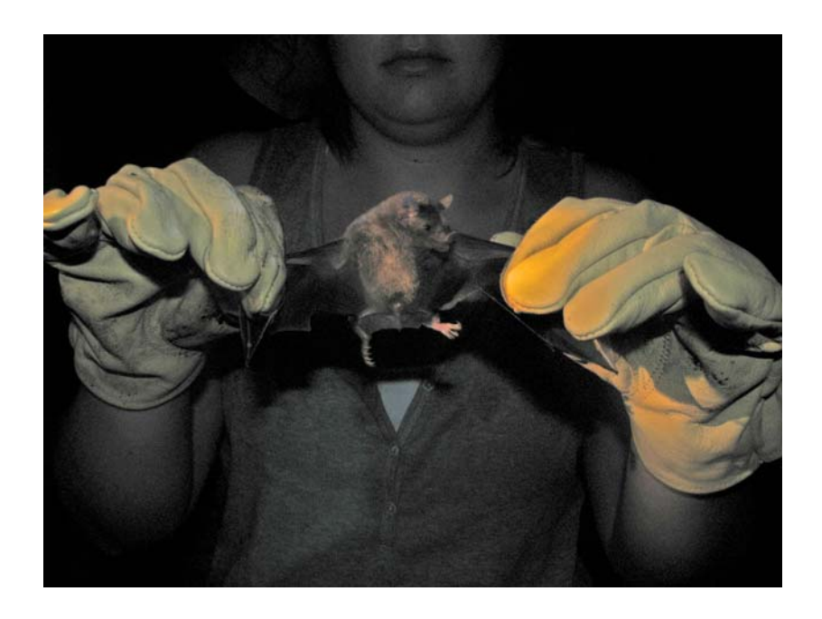
Figure 13. A photograph of M. plethodon showing the overall appearance and size of the bat.