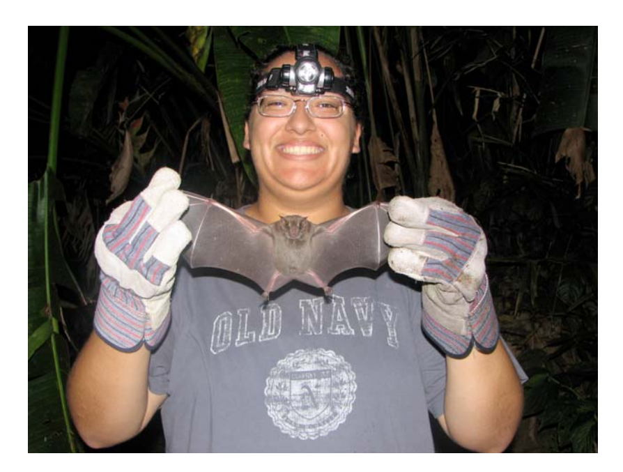
Figure 1. A picture of A. jamaicensis showing the general size of the bat and the bat's overall appearance.

Artibeus jamaicensis may be confused for S. lilium or A. nichollsi due to the fact that the three species are fairly large leaf-nosed bats. However, compared with S. lilium, A. jamaicensis has a noticeable uropatagium (Fig. 4) and S. lilium has very hairy legs. When one compares A. jamaicensis and A. nichollsi, one of the main differences is that the uropatagium on A. nichollsi is very furry (Pedersen 2005) as opposed to the naked uropatagium of A. jamaicensis (Fig. 4).